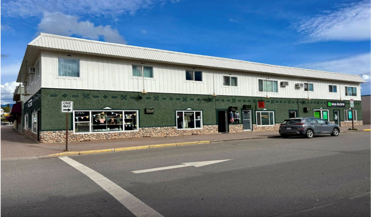
Figure 2. Photo of the subject property, showing the subject property (corner unit) from the Fourth Avenue elevation.