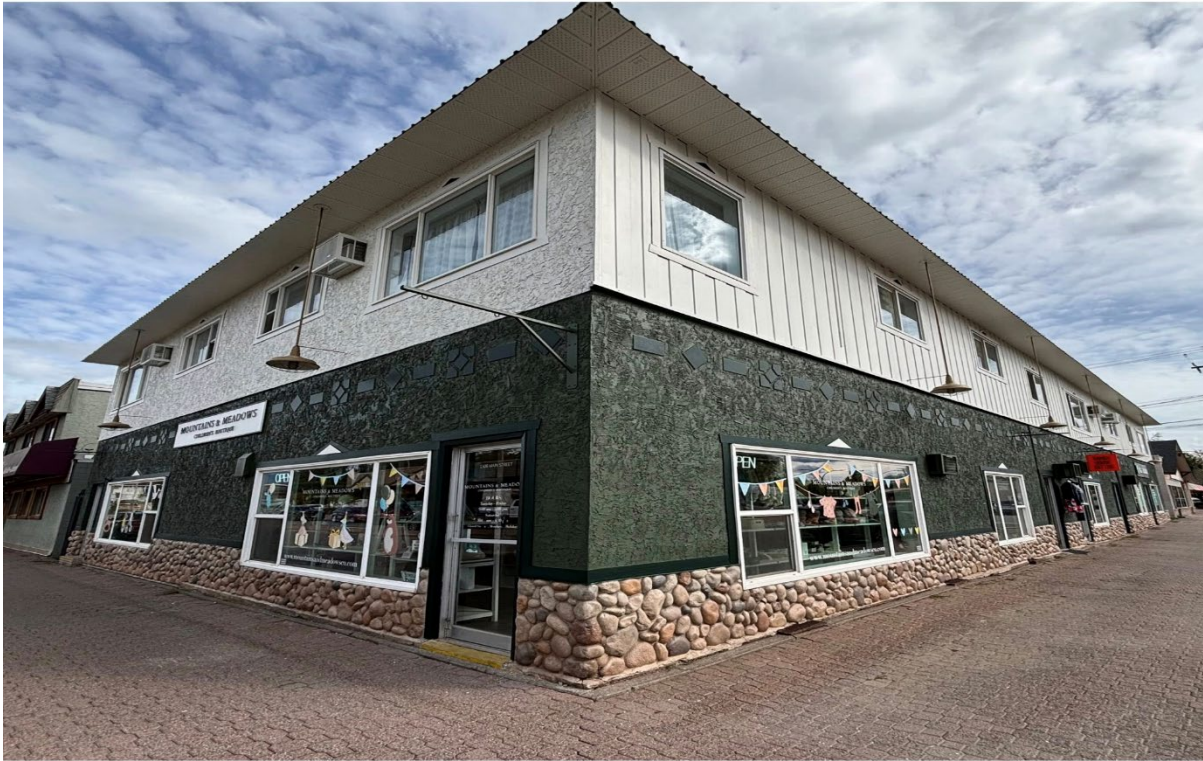
Figure 3. Photo of the subject property, showing the subject property from the Main Street intersection perspective.