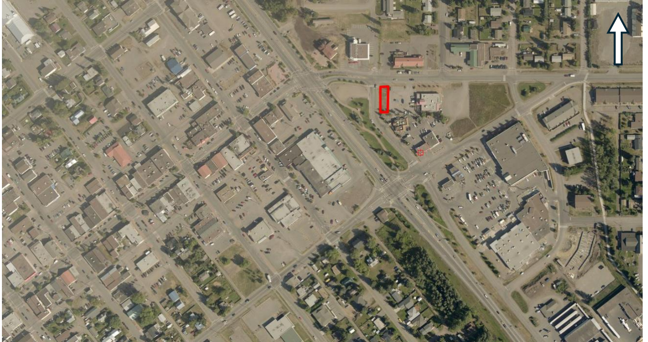
Image 1: Location of the subject property next to the Main Street-Frontage Road intersection