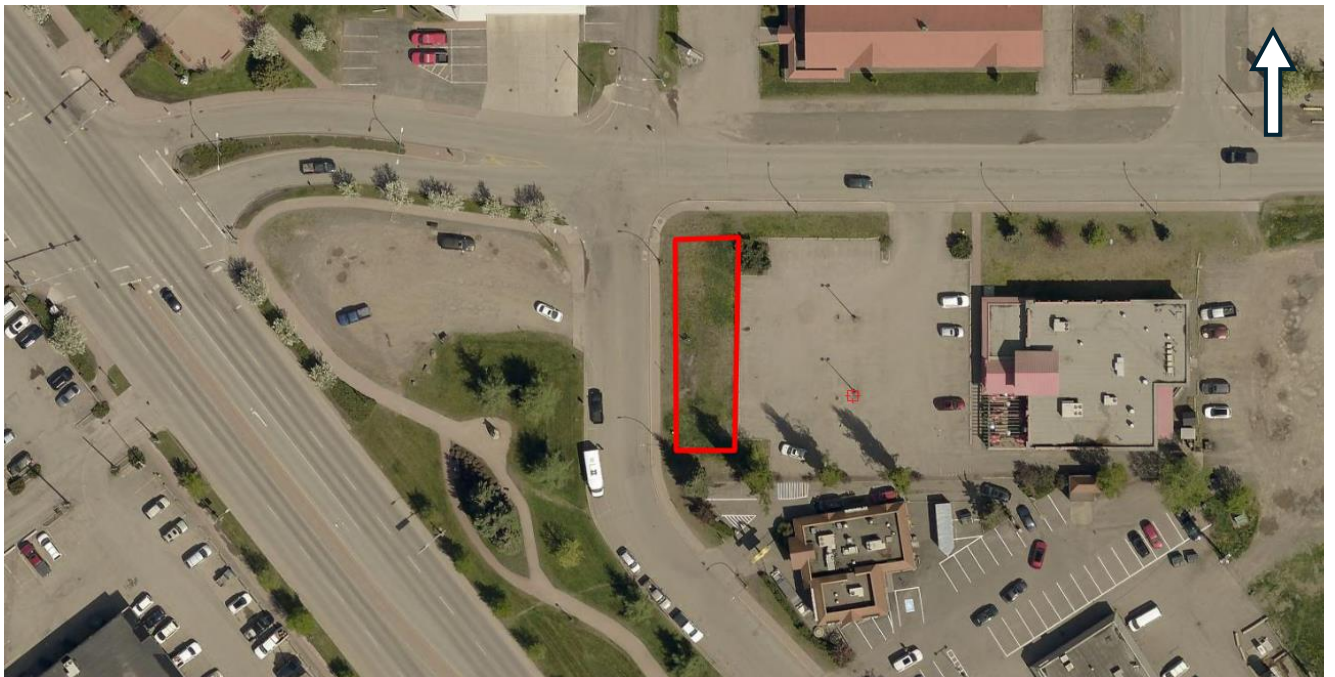
Image 2: Parcel is located opposite to the Goat Park parking lot; for traffic safety reasons, on-street parking is not currently permitted in front of the subject parcel.