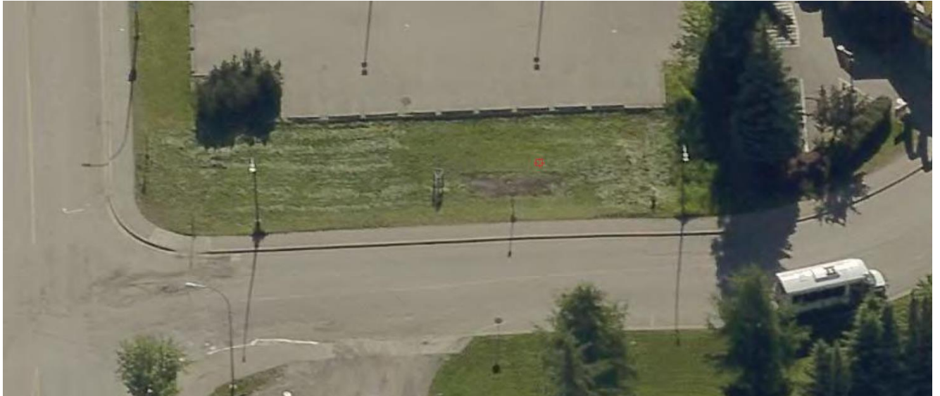
Image.3 As part of the development, the Developer will widen the abutting portion of Frontage Street, creating three new on-street parking stalls. This will require relocating the existing sidewalk closer to the property line.